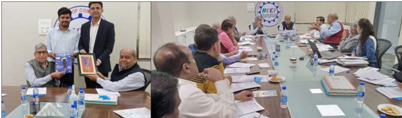
UIWM&RC Trust Meeting (1) & (2)