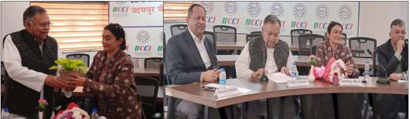
Celebration of First Position of Udaipur Airport in Excellence Survey

UCCI organized an event to commemorate the remarkable achievement of Udaipur Airport team to get first position out of 57 airports by scoring 4.99 marks out of total 5 points on 33 different parameters. The Maharana Pratap Airport, Udaipur has been titled as the best airport for the third consecutive year in a row.