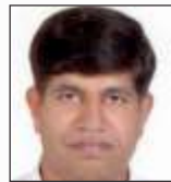
Siddharth Chatur Comfort Tours & Travels Pvt Ltd