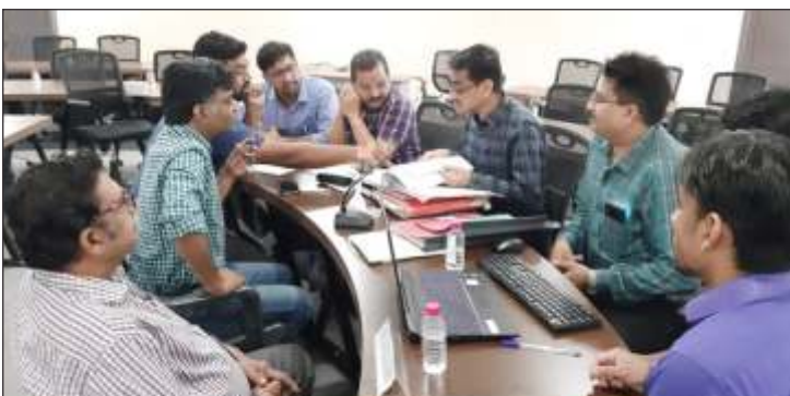
One Day Amnesty Camp at UCCI

RIICO organised a One Day Amnesty Camp for the benefit of UCCI members wherein the officials provided guidance regarding Amnesty scheme to the member participants.