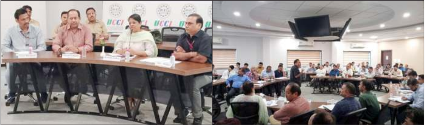
Session on “Understand your Electricity Bill”

Session on “Understand your electricity bill” facilitated by the experts from Secure Meters was held at UCCI. The two hour long session was highly interactive and the participants received valuable information and their queries were also addressed.