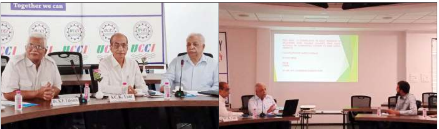
Session on Wealth from Waste materials