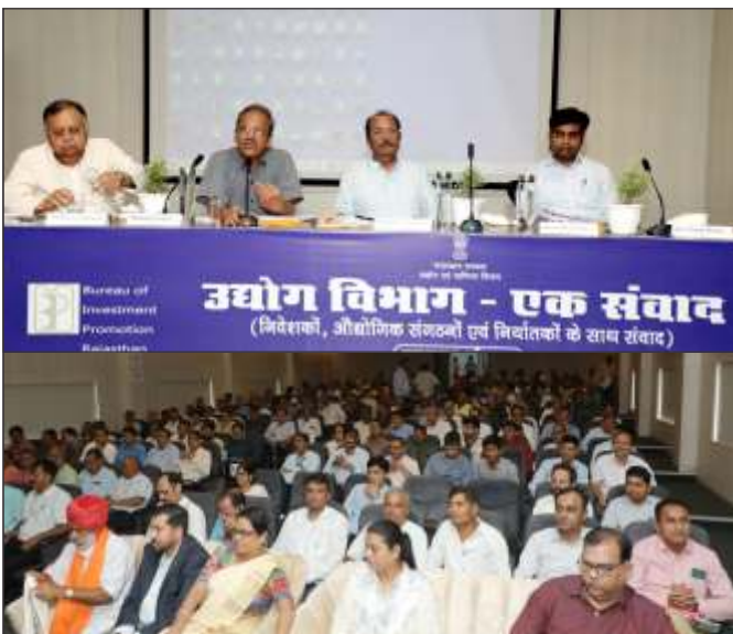
Interactive Session with Department of Industries - "SAMVAD"