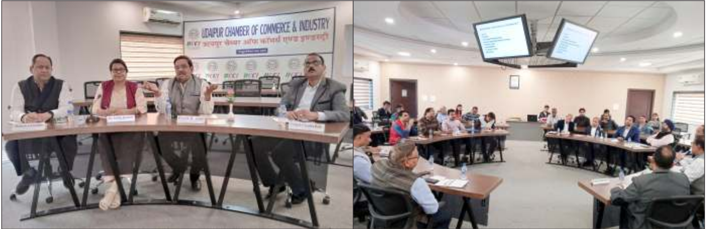
Awareness Program on "Lean Six Sigma Tools & Techniques for Process & Quality Improvement"