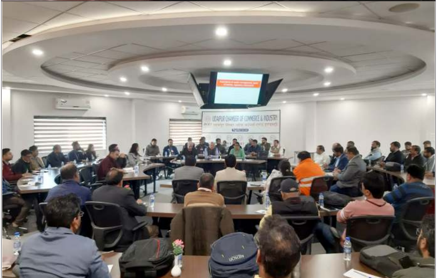
Training Program on Waste Management and Circular Economy