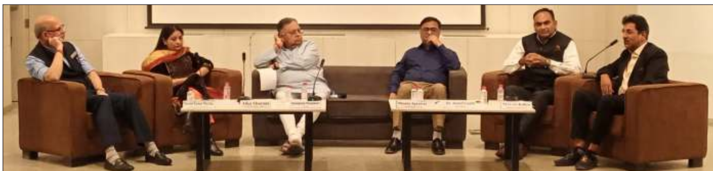
First Panel Discussion on UCCI Excellence Awards