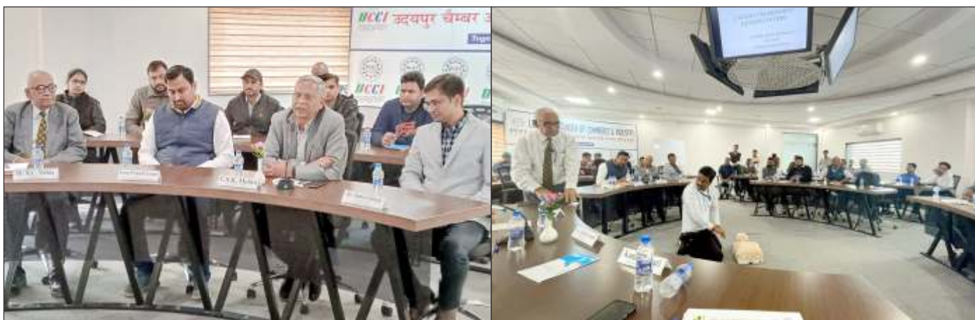
Awareness Program on "Lean Six Sigma Tools & Techniques for Process & Quality Improvement"

A Workshop on Occupational Health and Safety was organised wherein the focus areas were Occupational Health Surveillance, Prevention of Occupational Lung Diseases, Shift work in Industries, Hazard Control, Noise and dust induced health hazards etc.