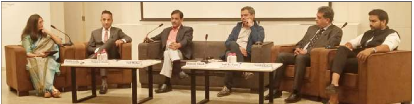
Second Panel Discussion on UCCI Excellence Awards