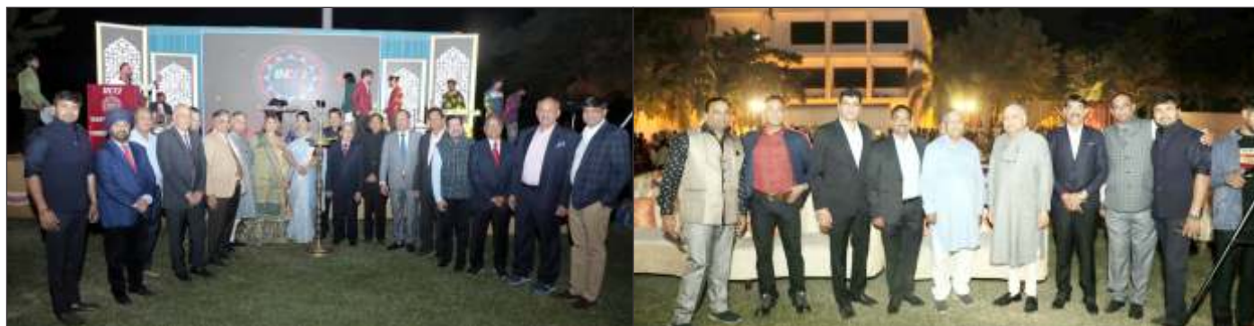
Deepawali Sneh Milan Program