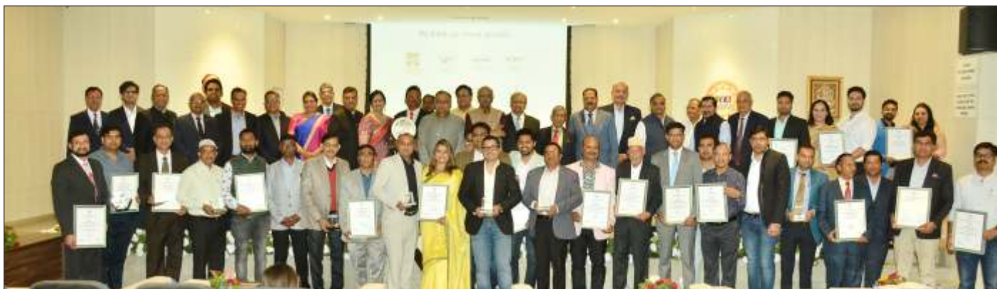
UCCI Excellence Awards 2023 Winners