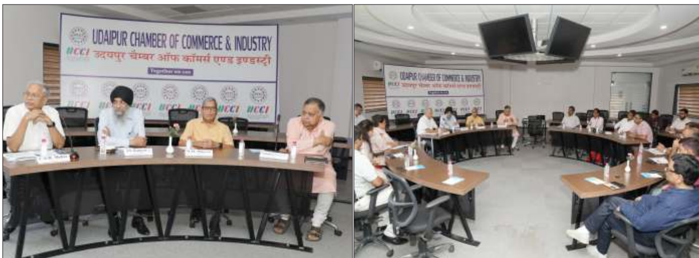
Training Program on Environmental Management Practices