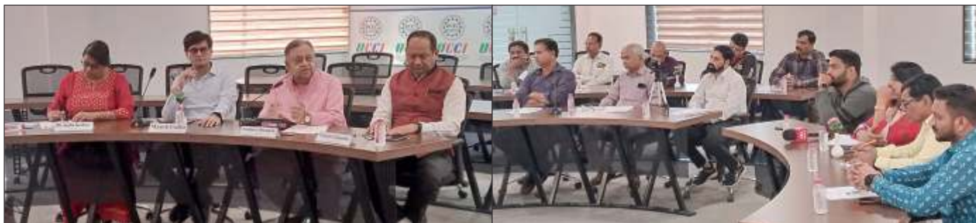
Office Bearers and members of Standing Committee addressing media representatives

Press Conference on UCCI Excellence Awards was organised on 11th November 2022 at 12.00 noon at Pyrotech Tempsens Hall. Approximately 30 representatives from various Press and Electronic Media groups participated in the conference wherein Office Bearers and members of Standing Committee on UCCI Excellence Awards briefed regarding the UCCI Excellence Awards 2023.