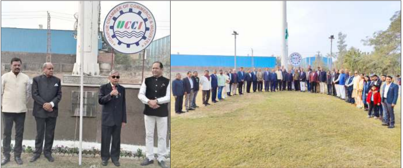
Republic Day Celebration Program