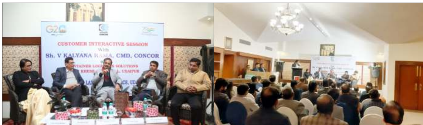
Container Corporation of India program