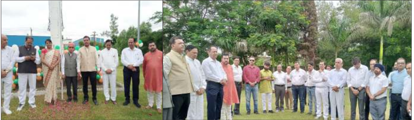
Independence Day Celebration Program