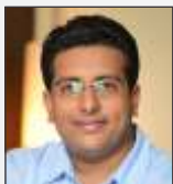
Arihant Dugar Dugar Marble & Granites