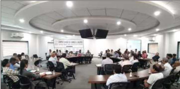
Interactive session with Secretary Science & Technology Deptt.