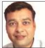
Prakhar Babel Bharat Polychem Industries